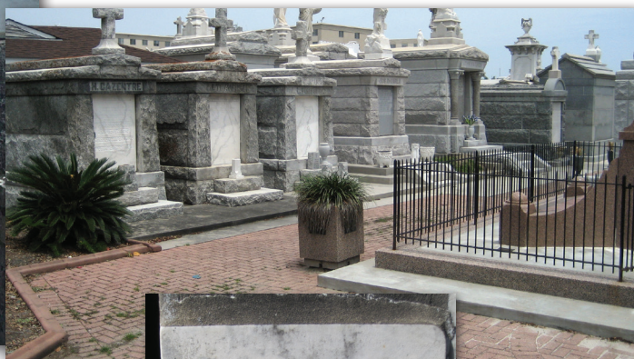
Figure 4. St. Louis Cemetery No. 3 in New Orleans.