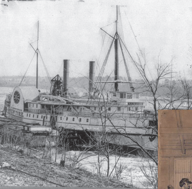
Figure 2. Flag of Truce boat New York , on which the Cormier cover on page 38 traveled.

Returned prisoners of war exchanging their rags for new clothing on board Flag of Truce Boat New York . By Alfred R. Waud, artist for Harper's Weekly .