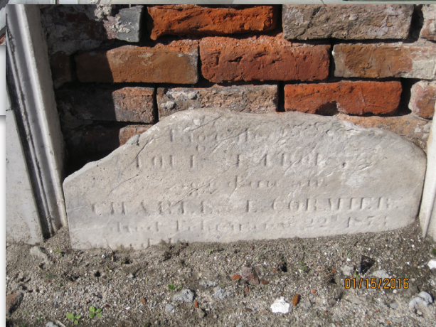
Figure 5. Fragment of the headstone of Charles Émile Cormier.