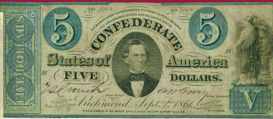
Figure B. Christopher Gustavus Memminger, 1880 engraving.

other municipal employees were removed to the Orphan House by December of 1863.