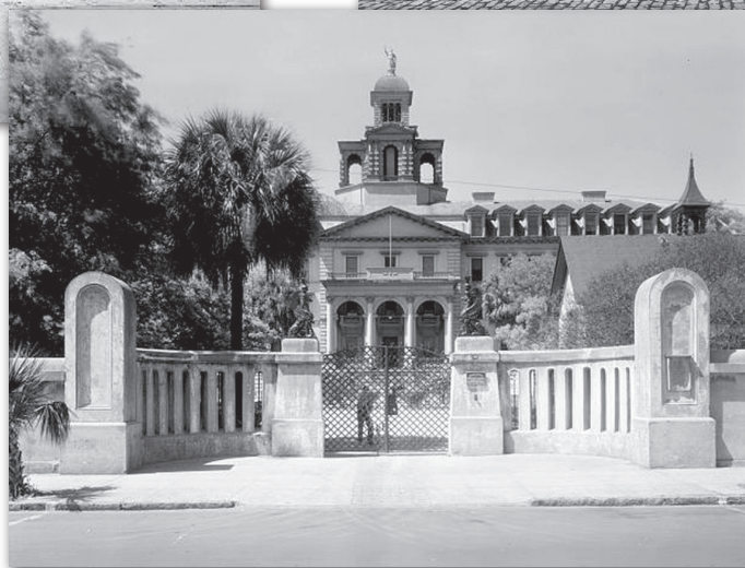
Figure 4. Charleston Orphan House, 1944, near the end of its existence.

Founded during an era in which most African-Americans in South Carolina were held as chattel slaves, the Orphan House admitted only the poorest white children of European descent. Although the institution was officially created in 1790, the Charleston Orphan House was housed in temporary quarters during its first four years.