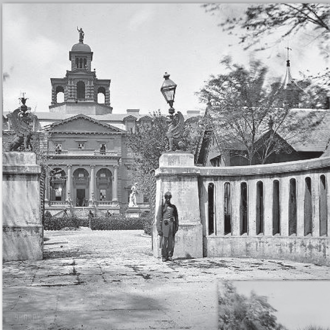
Figure 2. Charleston Orphan House, 1865, right after the war.