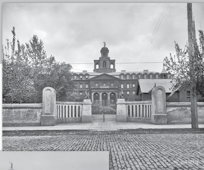
Figure 3. Charleston Orphan House, circa 1900.