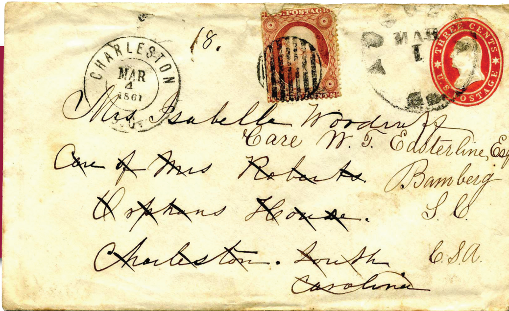
Figure 1. Confederate use of U.S. postage from Augusta, Ga., addressed care of Orphans House, Charleston, S.C. The 3-cent star-die entire was readdressed and forwarded to Bamberg, S.C., C.S.A. with a 3-cent 1857 issue.