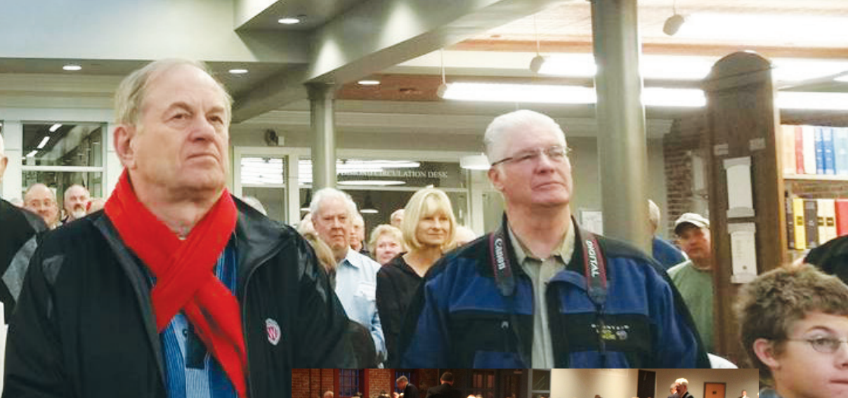
A partial view of the crowd watching the dedication ceremonies on the main floor of the APRL. Stamp collectors!—all ages, all walks of life. The way it's always been!