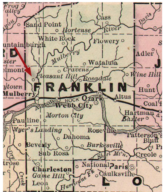
Figure 2 (right). 1889 map of Franklin County, showing the location of Pleasant Hill (see arrow).