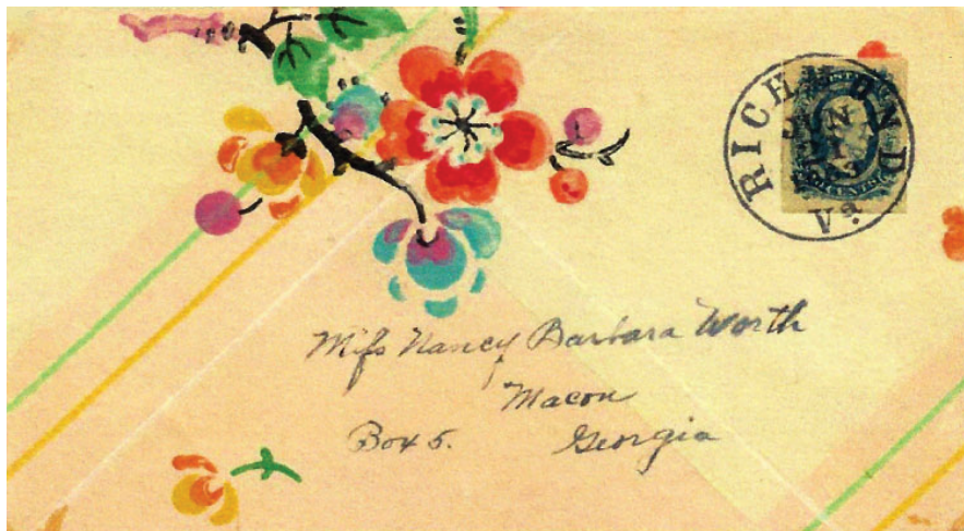
Figure 3. A 1932 Dietz-created wallpaper cover franked with a genuine Scott CSA 11 tied by a fake 1863 postmark.

I contacted the listing seller and explained the history of his listing. He wanted to know if I wanted to buy it for $200. Thank you, no. He is from Poland. He said he inherited a large collection from his uncle in 2009 and he was certain the stamp was genuine because his uncle paid $260 for it long ago. I explained that the stamp was indeed genuine but everything else about the item was modern. Regardless, the genuine stamp only catalogs $20 in Scott and it is canceled with a fake cancel. I suggested he verify what I said with known Confederate specialists and gave him some names at his request. The cover is