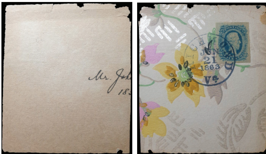
Figure 2 (front and back). A piece of a 1932 Dietz wallpaper memento cover masquerading as a genuine 1863 use in a 2022 eBay offering.

Orders were taken for singles, pairs, and blocks of the 5¢ Jefferson Davis London print (Scott CSA 6), per cover, as well as singles, pairs and blocks of the 10¢ Jefferson Davis (Scott CSA 11 or CSA 12 – unspecified) per cover, with prices ranging from $2.50 to $10. At least one example has been seen