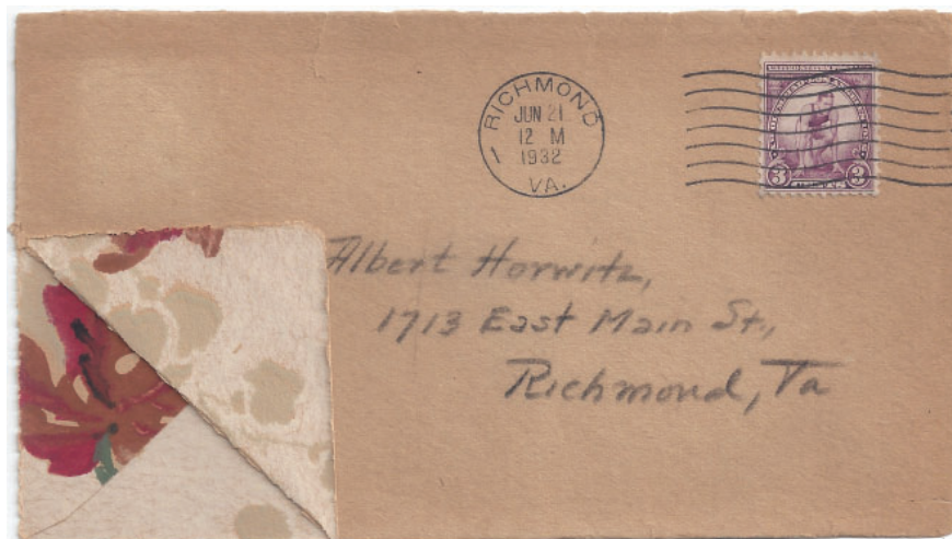
Figure 4. Another 1932 Dietz memento showing the plain side; the wallpaper with the Confederate stamp and 1863 postmark are inside.

It is not surprising that the 1932 Dietz creations show up on eBay as genuine. I have one in my Rogues Gallery, but the image is so poor that it can't be shared here in