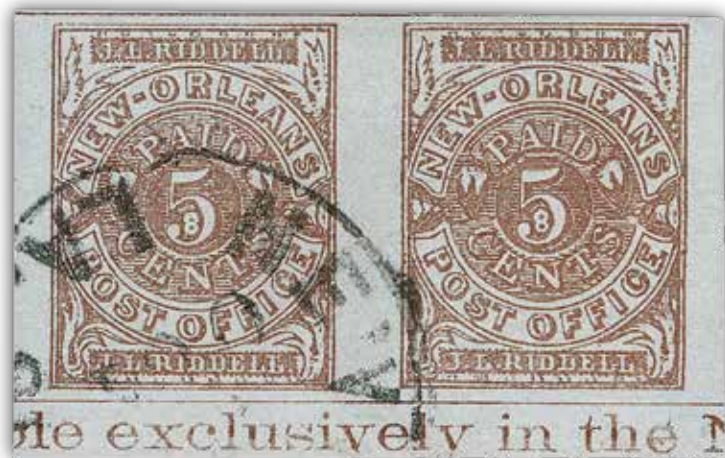
Figure 5. A used bottom-margin imprint pair of the typographed 1861 5¢ red brown on bluish paper New Orleans, Louisiana, postmaster provisional, Scott 62X4.

Madison Fla has offered P Office Stamps contrary to Law.”