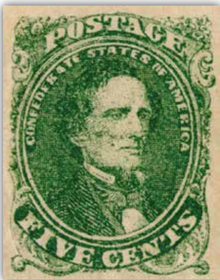
Figure 7. Five months after postal service between North and South ended, this 5¢ Jefferson Davis – the first Confederate general issue – was printed and sold on October 16, 1861.