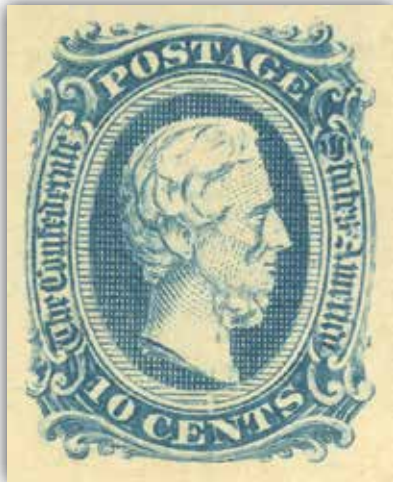
Figure 8. This 1863 10¢ milky blue Jefferson Davis (Scott 11a) catalogs $18 unused, or $17 in the deep blue 1864 printing by Keatinge & Ball. The stamp also comes in four additional shades and perforated 12½, with many different cancels and uses as well.

scribble from a general officer who served at Gettysburg? Or did he die on the Mississippi river boat Sultana along with 1,800 other unfortunate souls on their way home from Andersonville Prison, after having endured the horrors of captivity? It is up to you to ferret out the story. It's enlightening, it's engrossing, and it can be a real adventure. Finally, properly identifying your patient may turn a $50 purchase into something worth four figures or more. Now, that's exciting!