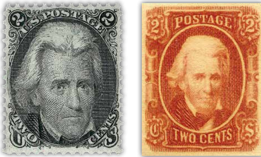
Figure 9. Andrew Jackson on 2¢ stamps issued in 1863 by the USPOD (the “Black Jack,” Scott 73) and the CSPOD (in pale red [First Printing], Scott 8a).

When the South got news of the North issuing a stamp depicting one of their heroes, the Confederacy used the very same portrait for 2¢ pale red and brown red stamps (Scott 8-8a) issued in the spring of that year. Their earliest recorded use is April 21, 1863 — more than two months earlier than the U.S. Black Jack. The Northern and Southern stamps appear side by side in Figure 9.