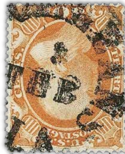
Figure 2. This U.S. 30¢ orange Franklin, Scott 38, has a New Orleans, Louisiana, 3 February 1861, circular datestamp, used during the state's nine-day period as an Independent State.