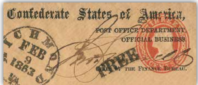
Figure 10. A CSA Post Office Department imprint and free frank on a 3¢ U.S. Nesbitt envelope that was not returned to the USPOD when war began. Many devalued envelopes were used on official CSPOD business.

Isolated from world markets by Union Navy blockades, Southerners experienced shortages of almost every kind of commodity. Paper became almost unobtainable toward the close of the war. As a result, every available scrap with writing space was pressed into service, creating a collecting category called adversity covers.