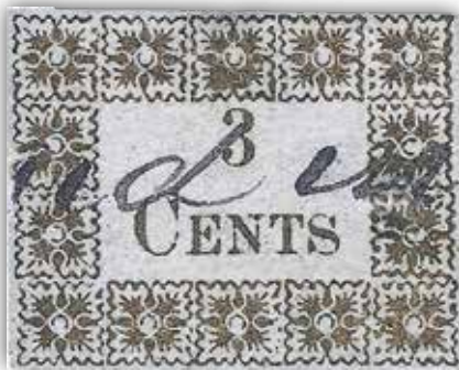
Figure 4. The first wartime Confederate postmaster provisional, the rare 3¢ Madison C.H., Florida, printed in gold on bluish paper, Scott 3AX1, with manuscript [“P]aid in [Money”] cancel.