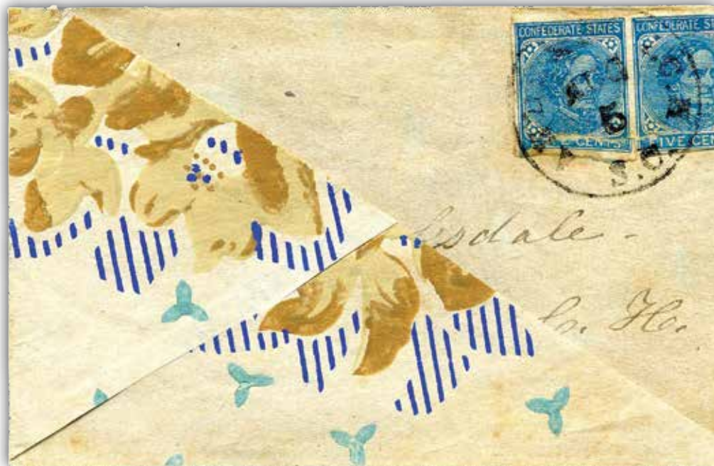
Figure 12. Two sides of the front of this Confederate adversity cover have been turned back to show that the envelope was fashioned from colorful wallpaper.

Turned covers were one of the first signs of the growing paper shortage. Envelopes from previous correspondences were carefully turned inside out, regummed and used again. Sometimes a single envelope was reused three or four times before the sheer weakness of its folds forced its retirement. The previous stamp was either removed or covered with a new one.