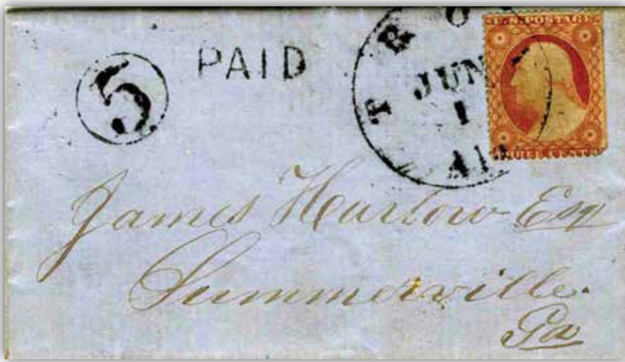
Figure 3. A first day cover of the Confederate postal system; it is not the U.S. 3¢ stamp that carried this Troy, Alabama, cover to Summerville, Georgia, but the “5” and “PAID” handstamped markings (representing the Confederate 5¢ letter rate) that showed payment of postage.