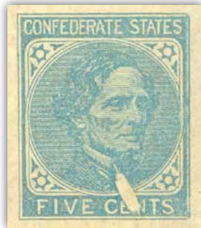
Figure 1. There are a limited number of Confederate general issues, but many collectible varieties to seek, such as this White Tie flaw on an 1862 5¢ Richmond print, listed as 7-L-v1 in the 2012 Confederate States of America Catalog and Handbook .

Figure 4 shows a used example of the first recorded provisional of this period, the rare — and, yes, valuable — 3¢ Madison, Florida, gold on bluish paper, Scott 3AX1, which caused a national scandal 158 years ago. Early in 1861, New York Herald Editor-Publisher James Gordon Bennett proclaimed: "The Post Master at