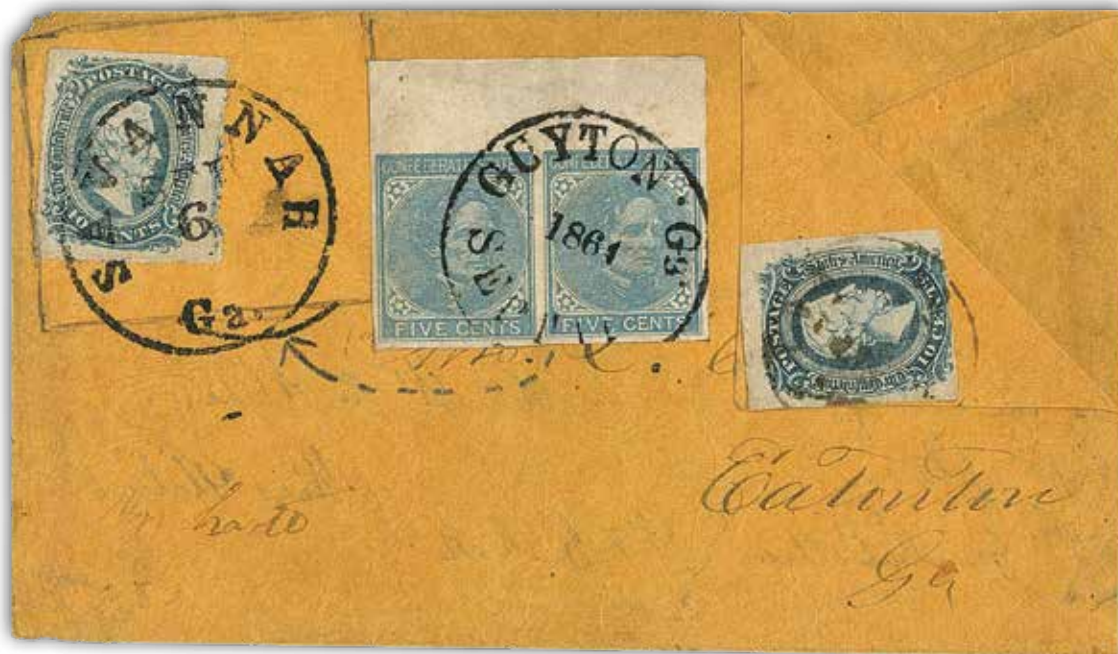
Figure 11. This thrice-turned cover crisscrossed Georgia three times in 1864: from Talbotton to Ways Station; then from Savannah to Eatonton; and, finally, from Guyton to Eatonton again. It has been opened for display.