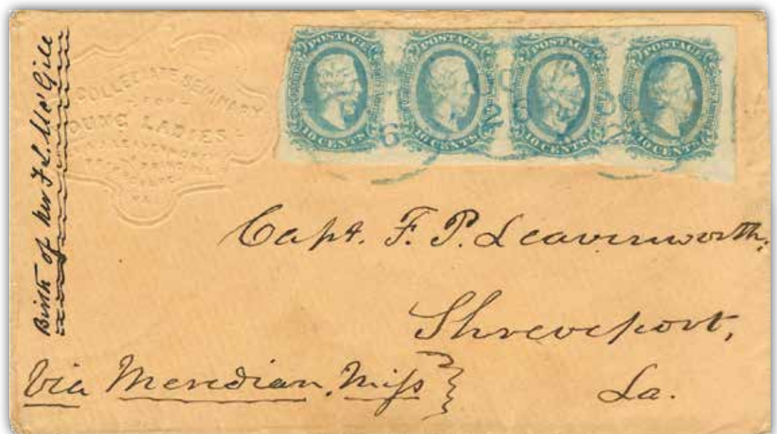
Figure 13. A strip of four engraved 10¢ Jeff Davis stamps correctly pays the 40¢ Trans-Mississippi rate on this embossed cover from the principal at a school for young ladies in Petersburg, Virginia, sent "Via Meridian, Miss" to a relative serving as a Captain in Shreveport, Louisiana, a distance of over 1,100 miles.

Today, we can view the very same documents via Fold3.com without the necessity of traveling to Washington, D.C. Even if I still lived in that area, I would probably use today's more convenient online resources. The information they impart can be incredibly useful to postal historians.