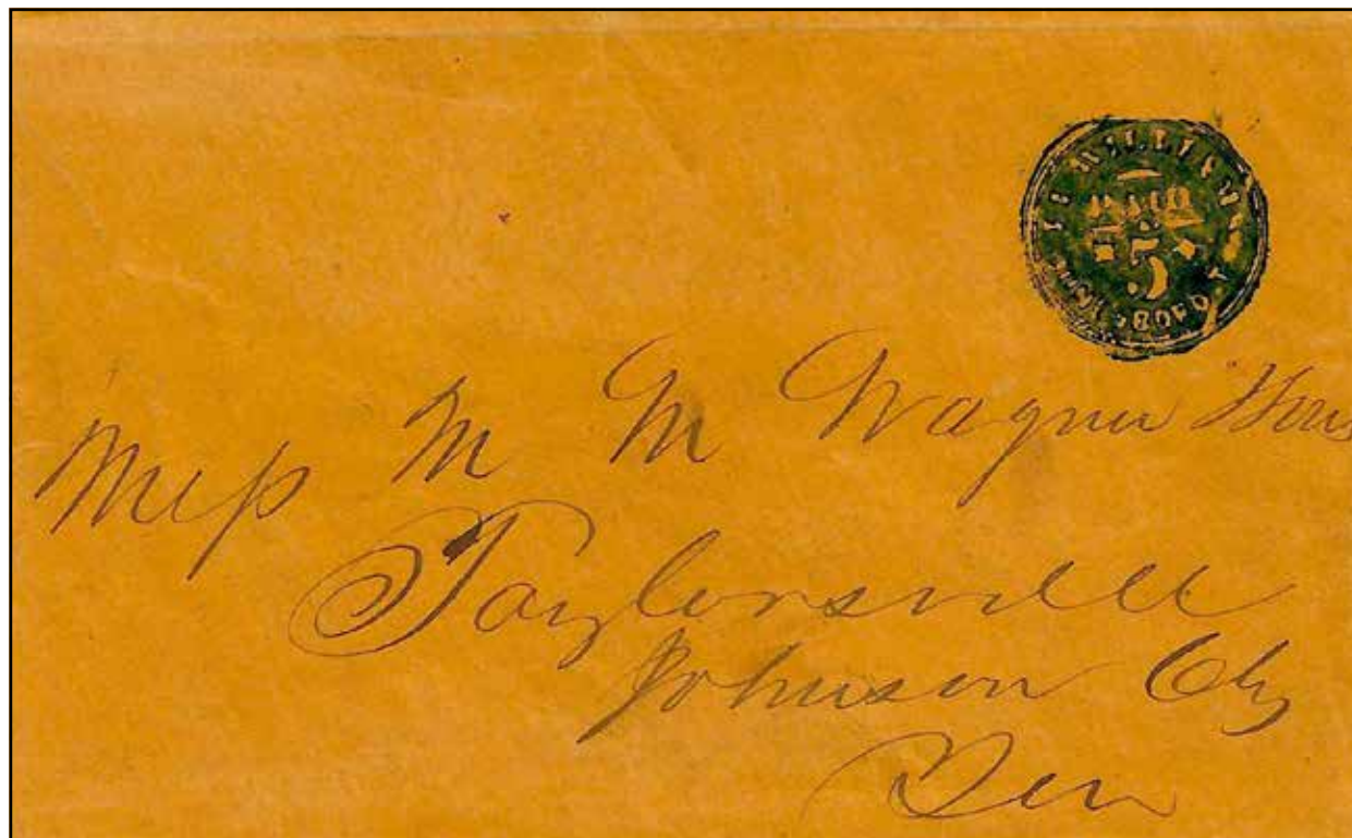
Figure 1: A Jonesboro, T., five-cent dark blue Postmasters' Provisional entire that bears no postmark, as is the case with fully half of the fourteen recorded examples.