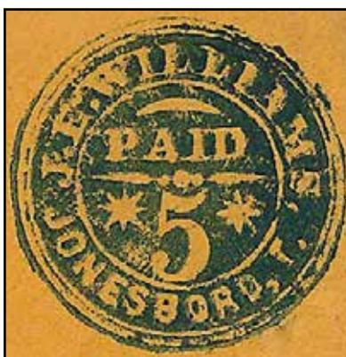
Figure 2: A close-up of the earliest of the five-cent paid blue Jonesboro provisionals, thus providing an exceptionally well-defined impression.

The Jonesboro provisional marking is in the form of a seal that features the rate in the center, the name of the postmaster (J.E. Williams), and the name of