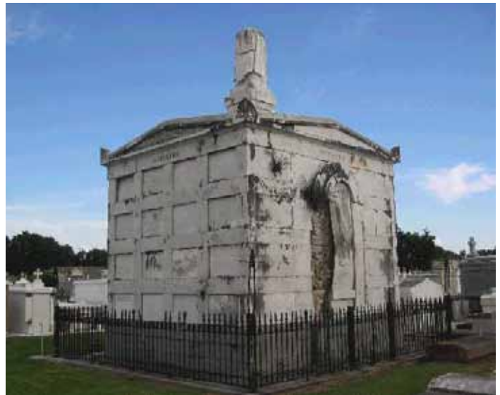
Figure 3: The Bringier family crypt in Ascension of our Lord Catholic Church Cemetery, Donaldsonville, Ascension Parish, Louisiana.