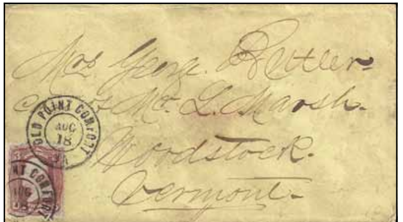
Figure 11: A Union use from Old Point Comfort with no Confederate connection.