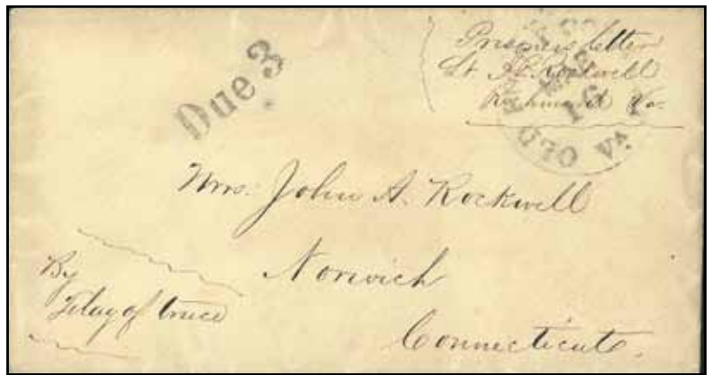
Figure 10: A prisoner-of-war cover with the large Old Point Comfort canceling device used early in the war.

I am grateful to Robert A. Siegel Auction Galleries for the majority of the images used in this article. My thanks also to the Library of Congress.