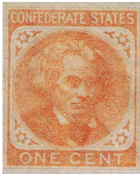
Figure 5. CSA 14a, 1¢ deep orange, honoring John C. Calhoun; printed by De La Rue, Ltd.

On Jan. 8, 1811, Floride married Calhoun, her first-cousin-in-once-removed (her father's first cousin). Soon after their marriage, her husband was elected to congress, leaving his wife in charge of his plantation Fort Hill, in present-day Clemson, S.C.