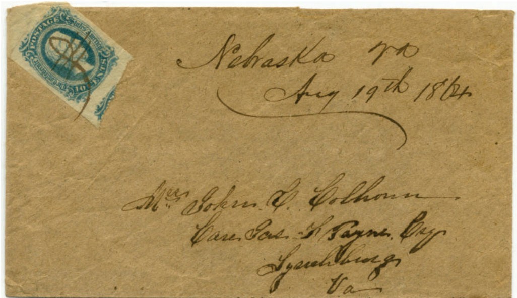
Figure 1 (above). CSA 11-AD, 10¢ blue, affixed over the edge of a cover used with the manuscript postmark of Nebraska, Va.