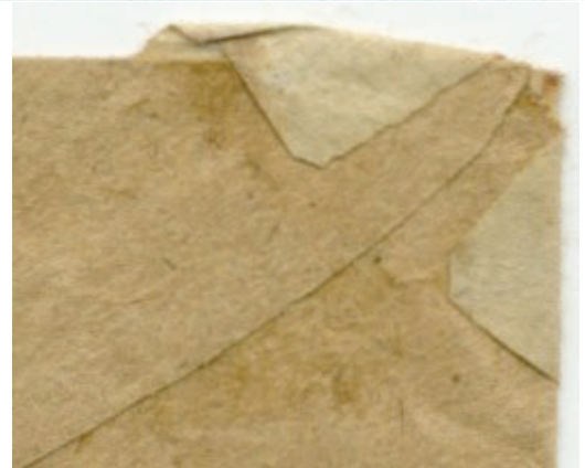
Figure 2 (right). Figure 1 cover shown from the back where the stamp selvage secures the stamp around the upper-left corner of the envelope.